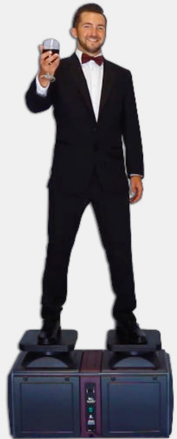
Do not attempt. Trained personnel in a controlled environment.

*Not all options are available for all units. Contact a distributor for more information.