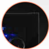
FULL GLASS DOOR